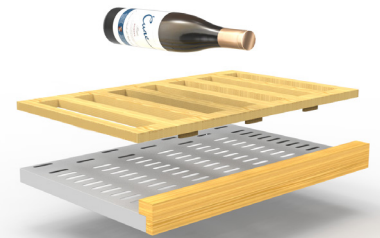
Option shelves: EVV100 & EVV200MX 203R34-01