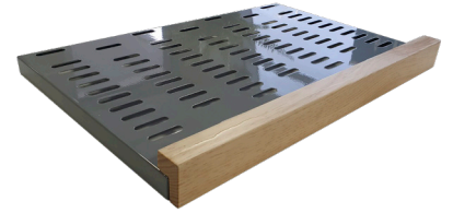
Standard shelves: EVV100 & EVV200MX

- Cord and NEMA 5-15P plug. - Electrical connection is 115V / 1ph / 60 Hz. - 15 AMP breakers required.